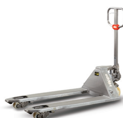
Stainless Steel/Galvanised HPT