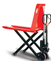
High Lift HPT