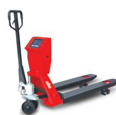
HPT With Scale