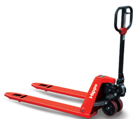
Mini & Low Profile HPT